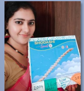
Rtn. Swapna Design